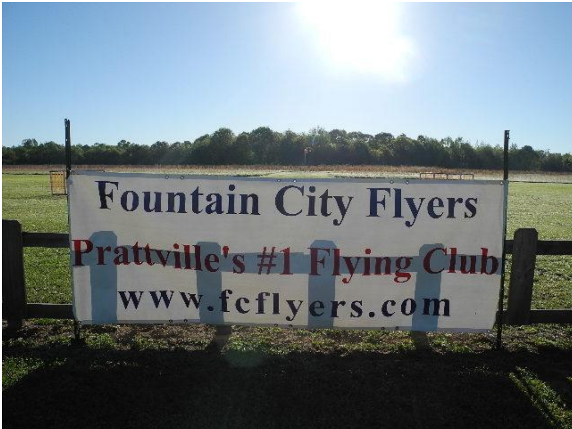
The local sponsoring club, Fountain City Flyers, had the field in great shape and did an outstanding job supporting the event.