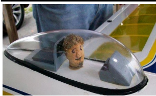
1965 hand-carved pilot figure done by my Dad. Has his own hair-lifelike