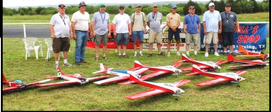
A happy bunch. Congrats on your 2nd contest...keep 'em coming..

The turn out among the members of the Golden Triangle RC Club, Grand Prairie, Texas, was fantastic. The pilots only had to concentrate on their flying and enjoy the event. A very special thanks to the many sponsors who donated some very nice prizes for the pilots and workers.