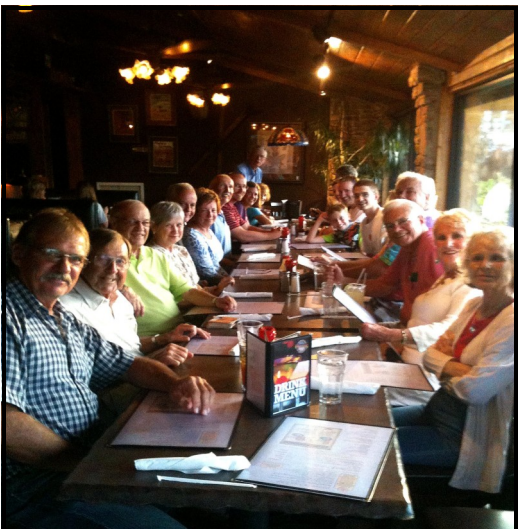
“Calhoun’s was a real hit on Saturday night as the new place to get together.