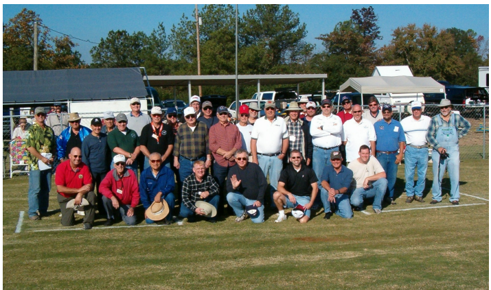
Above: Just before the flying started on Saturday morning. Pilots took a jiffy to pose for the SPA camera. Good Group!