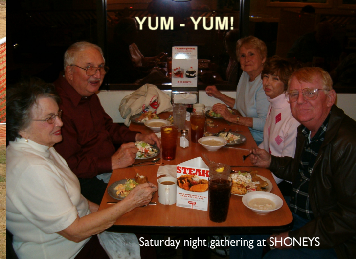
Saturday night gathering at SHONEYS