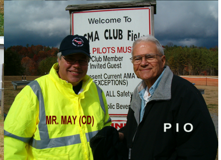
The VEEP (CD) and PRES (Newsletter Ed and PIO)