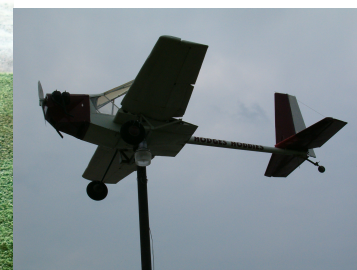
Left: "Piano-Finish" awards. Above: Huge wind-sock at HODGES HOBBIES FIELD