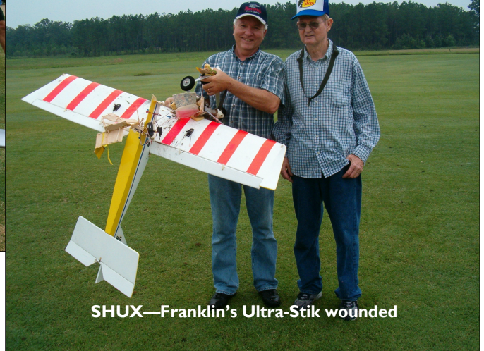
SHUX—Franklin's Ultra-Stik wounded