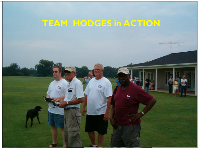
TEAM HODGES in ACTION