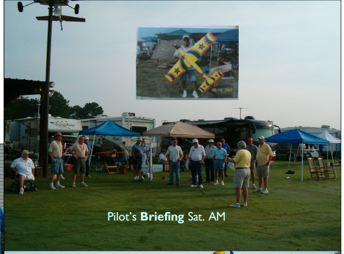
Pilot's Briefing Sat. AM