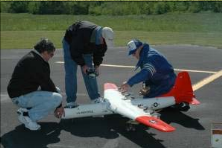
I count SIX engines on the Superfortress that flew a demonstration for the gang in Tulsa. A scale builders and flyers "delight".