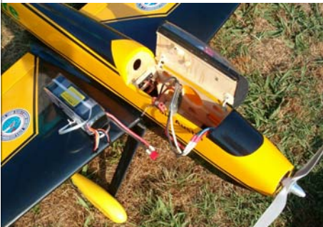
A look inside and a view of the THUNDER-POWER 6 cell 3850 MAH power pack which Sid says allows 14 minutes of flight. Plane has active flaps. He says "all is STOCK" !