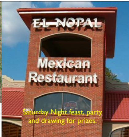
8:00p Saturday Night feast, party and drawing for prizes.