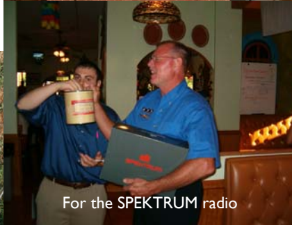
For the SPEKTRUM radio