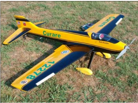
One of two "electrics" competing above is Sid Austin's CURARE. Wheel pants come with kit. Power is stock E-Flite 60 with 15/8 electric "thin-blade" prop. Phoenix 80 speed controller. Plane is built from MK kit plans. All-up weight is 6 lb—13 oz.