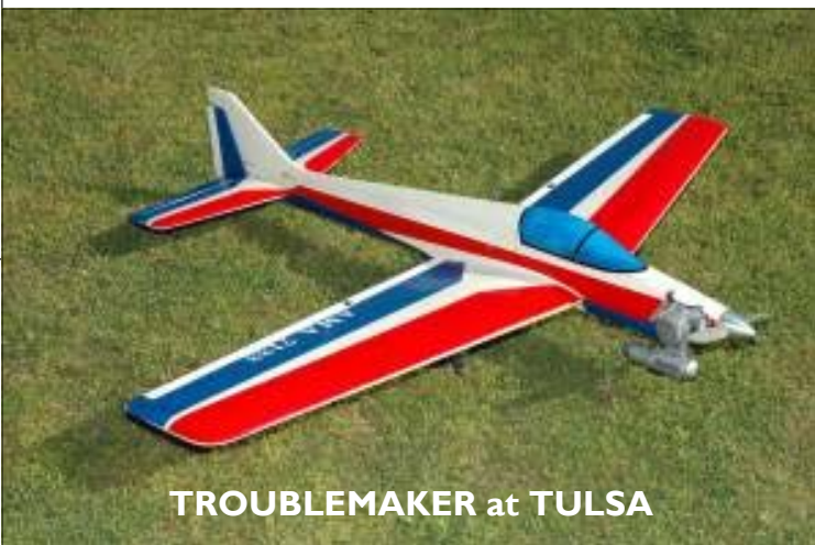
TROUBLEMAKER at TULSA