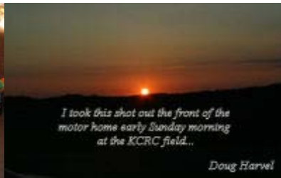
Isn't this a BEAUTIFUL shot ?

I took this shot out the front of the motor home early Sunday morning at the KCRC field...