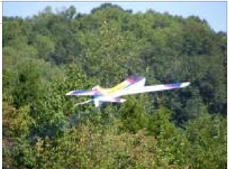
What a GREAT shot of the CURARE "on the wing" at KCRC Masters.

This has been a GREAT year for NOVICE participation. A good indicator of the future SPA competition.