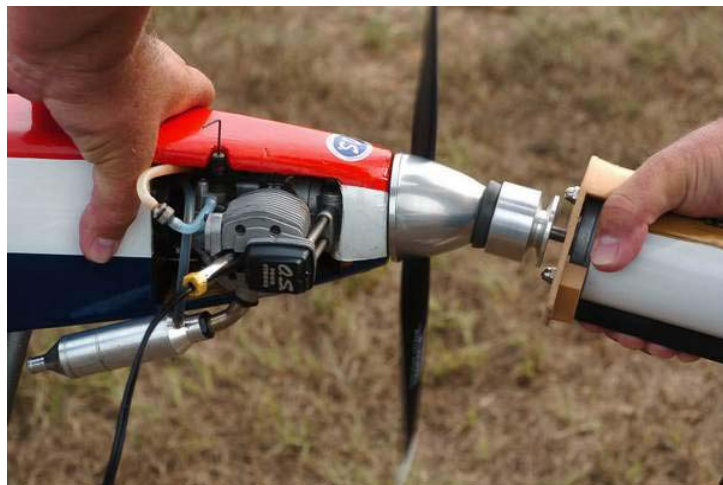
Aug. 18 -- An electric starter pushed against the prop helped start a model plane at The Fountain City Flyers' N. B. Reynolds Field in Autaugaville, AL. The FCFlyers club hosted the 2nd Annual Bill Johnston Memorial Senior Pattern Association contest.