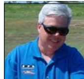
Tha’ “VEEP’S” Voice by: Scott Sappington

Old RC Electronics wanted.....Page 2 Art of Aerobatics—Marty King.....Page 3 Prattville “Season-Opener”.....Page 4 Cullman 10th Annual Contest.....Page 5 SPA/VRCS Tribute-D. Wilson.....Page 7