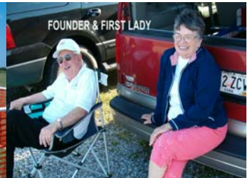
FOUNDER & FIRST LADY