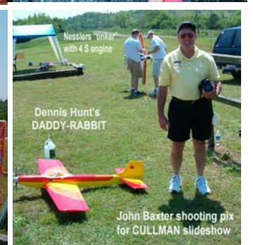
Nessler's "INKER" with 4 S engine