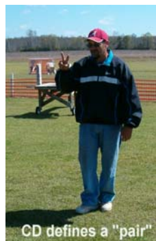
CD defines a "pair"

Power in model pictured was a DA-50 “gassie”.