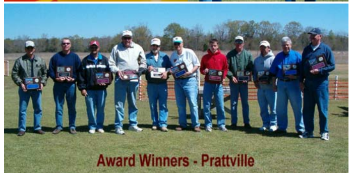
Award Winners - Prattville