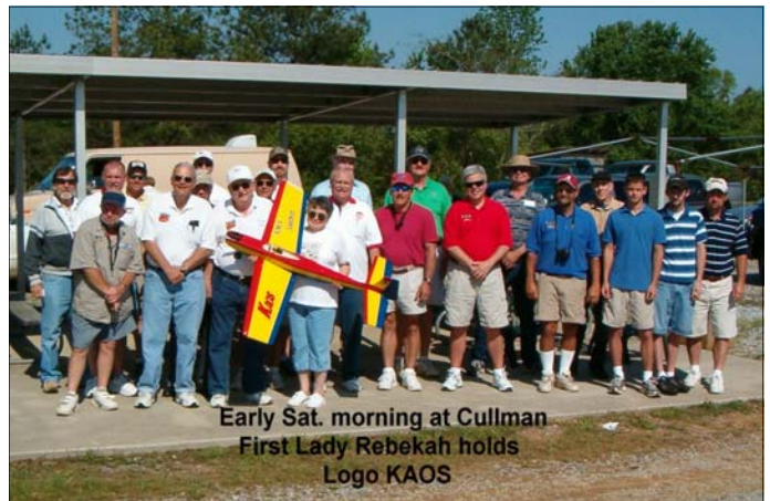
Early Sat. morning at Cullman First Lady Rebekah holds Logo KAOS