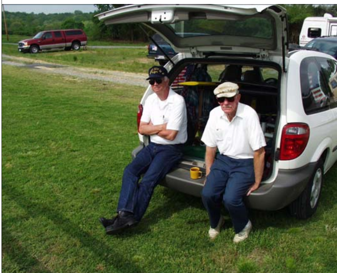
No need for lawn chairs when we have the rear of the nice SUV to rest on between rounds.