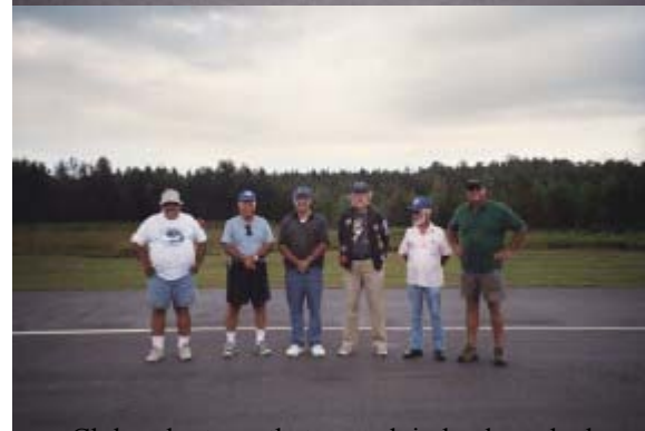
Club volunteers that scored, judged, cooked and made sure all attending enjoyed.